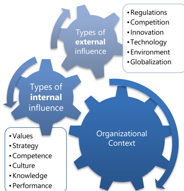
Figure 2: Examples of Internal & External Influences

Your organization identifies, analyzes, monitors and reviews factors that may affect our ability to satisfy our customers and stakeholders, as well as; factors that may adversely affect the stability of our processes and the integrity of the management system. Broadly, these issues are defined as: